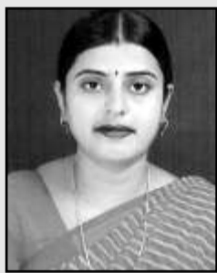
SMRIM LM No. 51